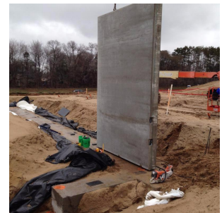
First wall up this week

If you are interested, please contact your child's homeroom teacher directly!